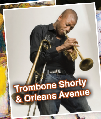
Trombone Shorty & Orleans Avenue

VIP Tickets and Reserved Seating Available