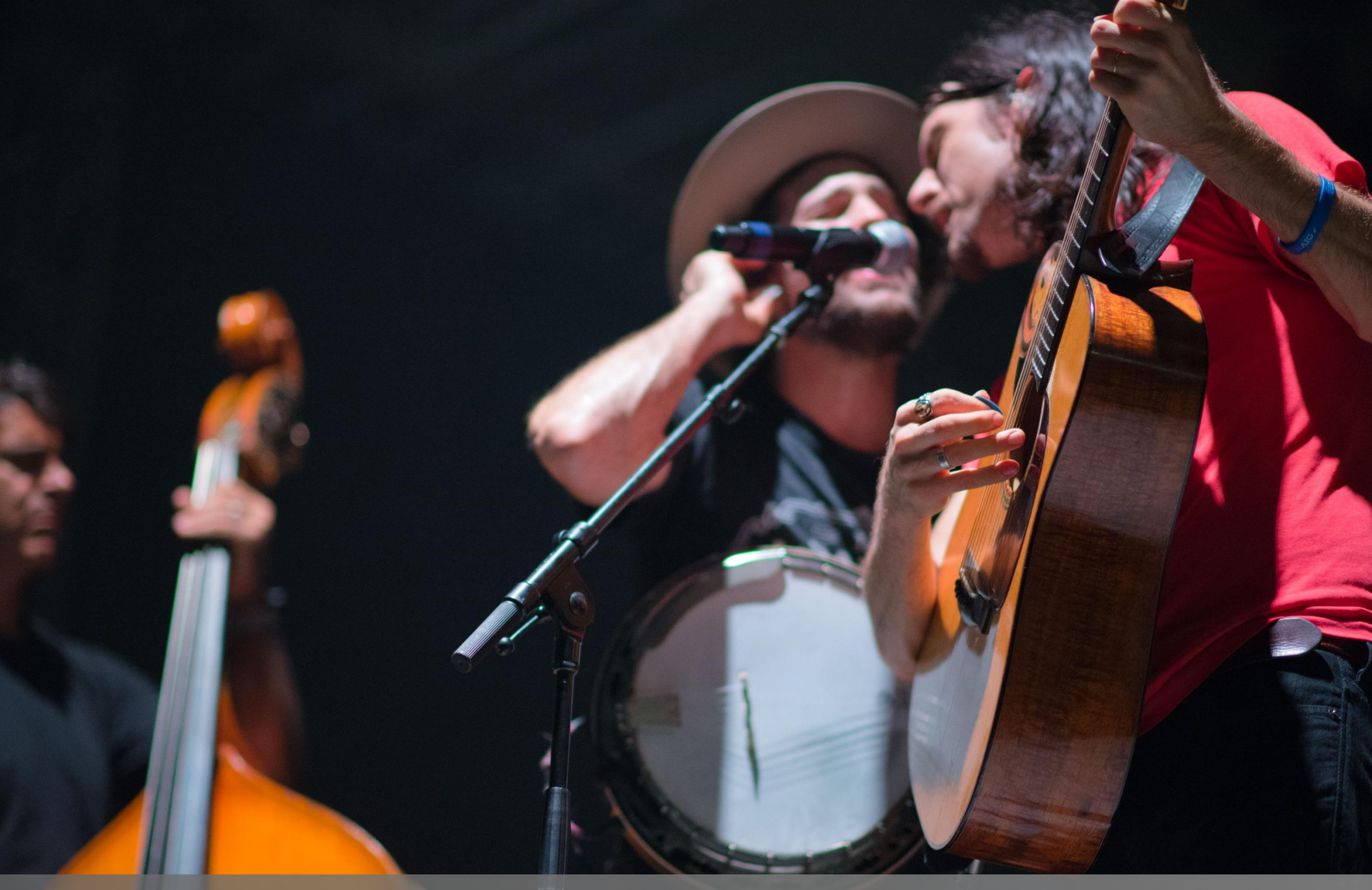
Something for everyone

One of the longest-running and best-known live music & jazz events in the country, the Clearwater Jazz Holiday's lineup is as diverse as its audience!