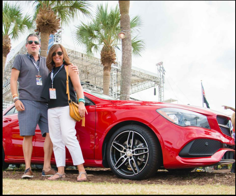
Sponsors enjoy a highly effective entertainment event marketed to an upscale, affluent, well educated audience.